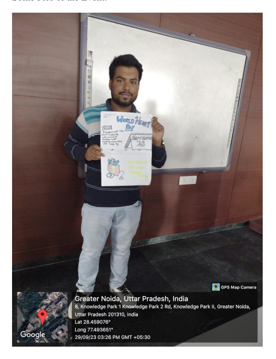
Figure 1 Student presenting his poster