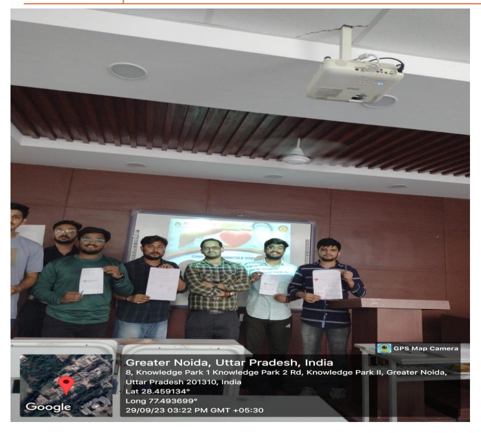
Figure 2 Group Photo