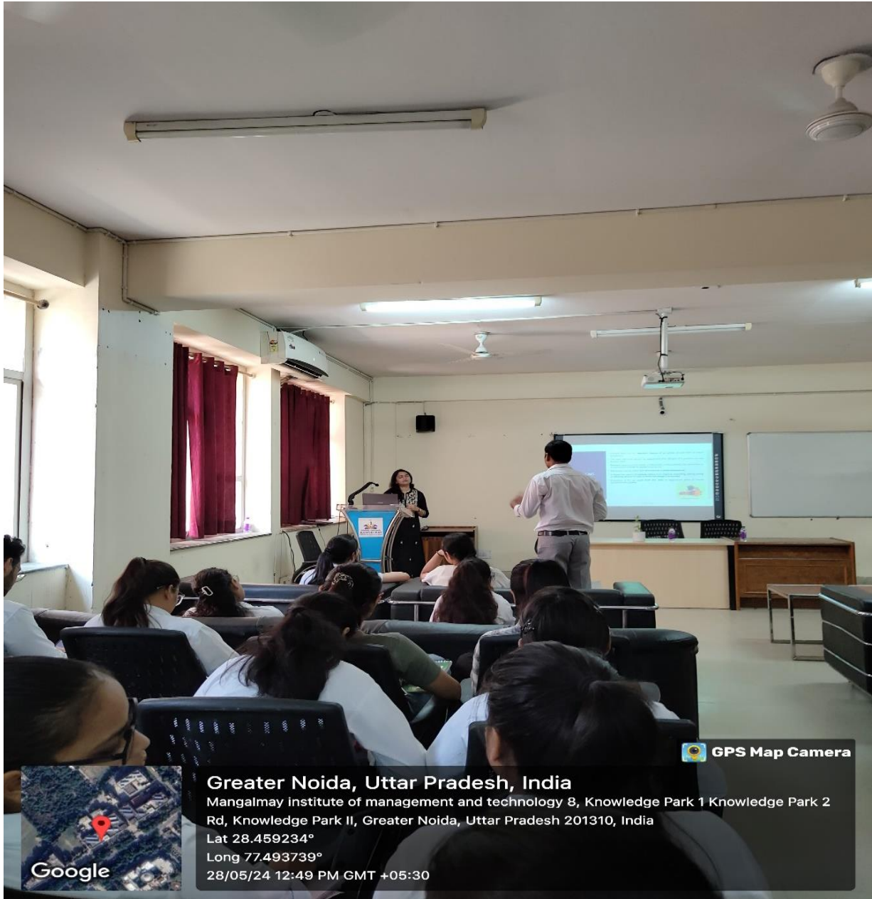
Pic 3: MBA students are interacting with the expert speaker