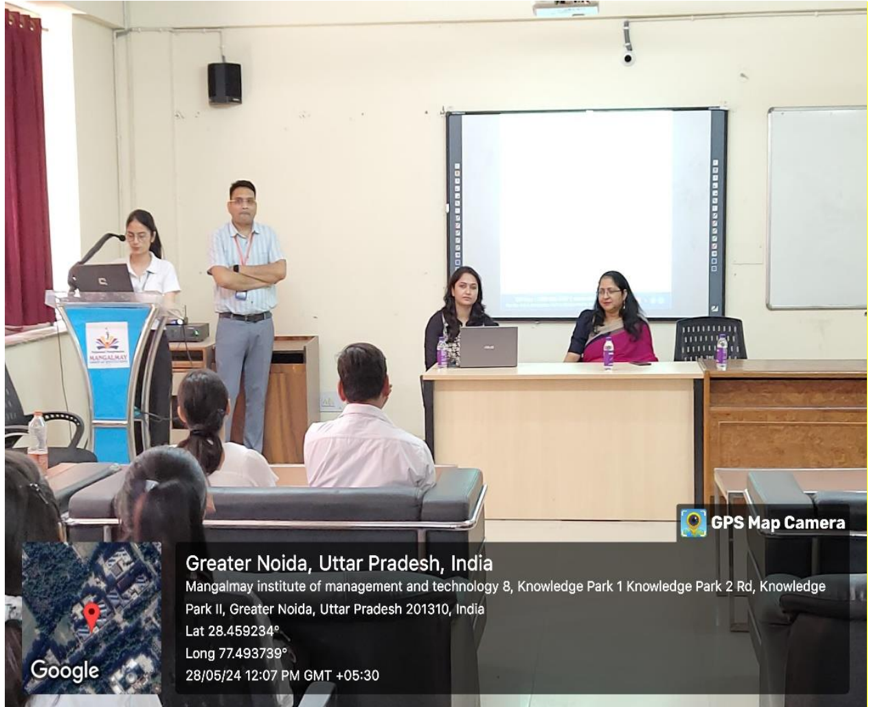
Pic 5 – Anchor is reading profile of the expert speaker