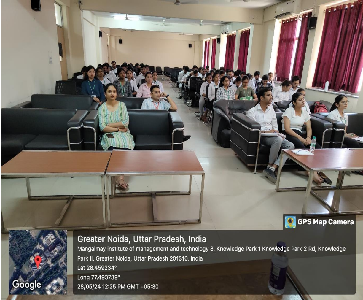
Pic 4: MBA students are listening carefully to the expert speaker