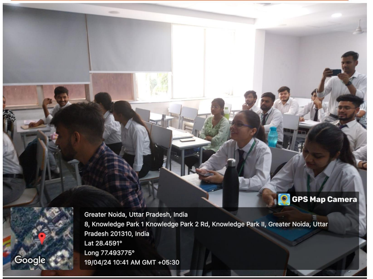
Figure 3 Student attending the session