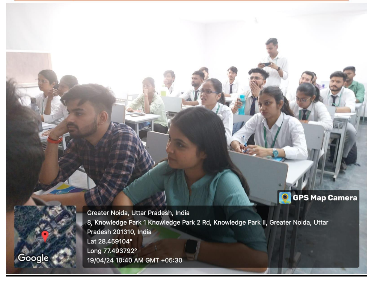
Figure 4 student attending sessions