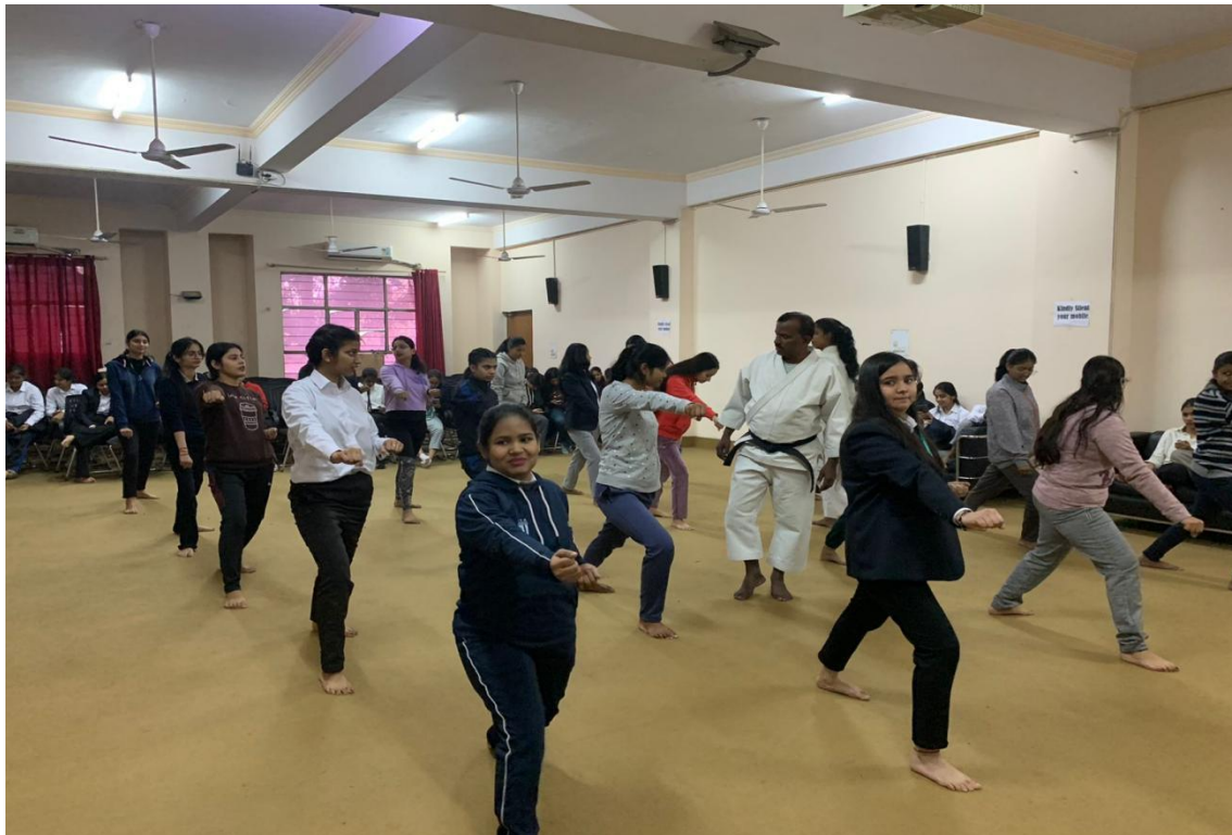
"Empower, Educate, and Execute: Unleashing the Art of Self-Defense!"