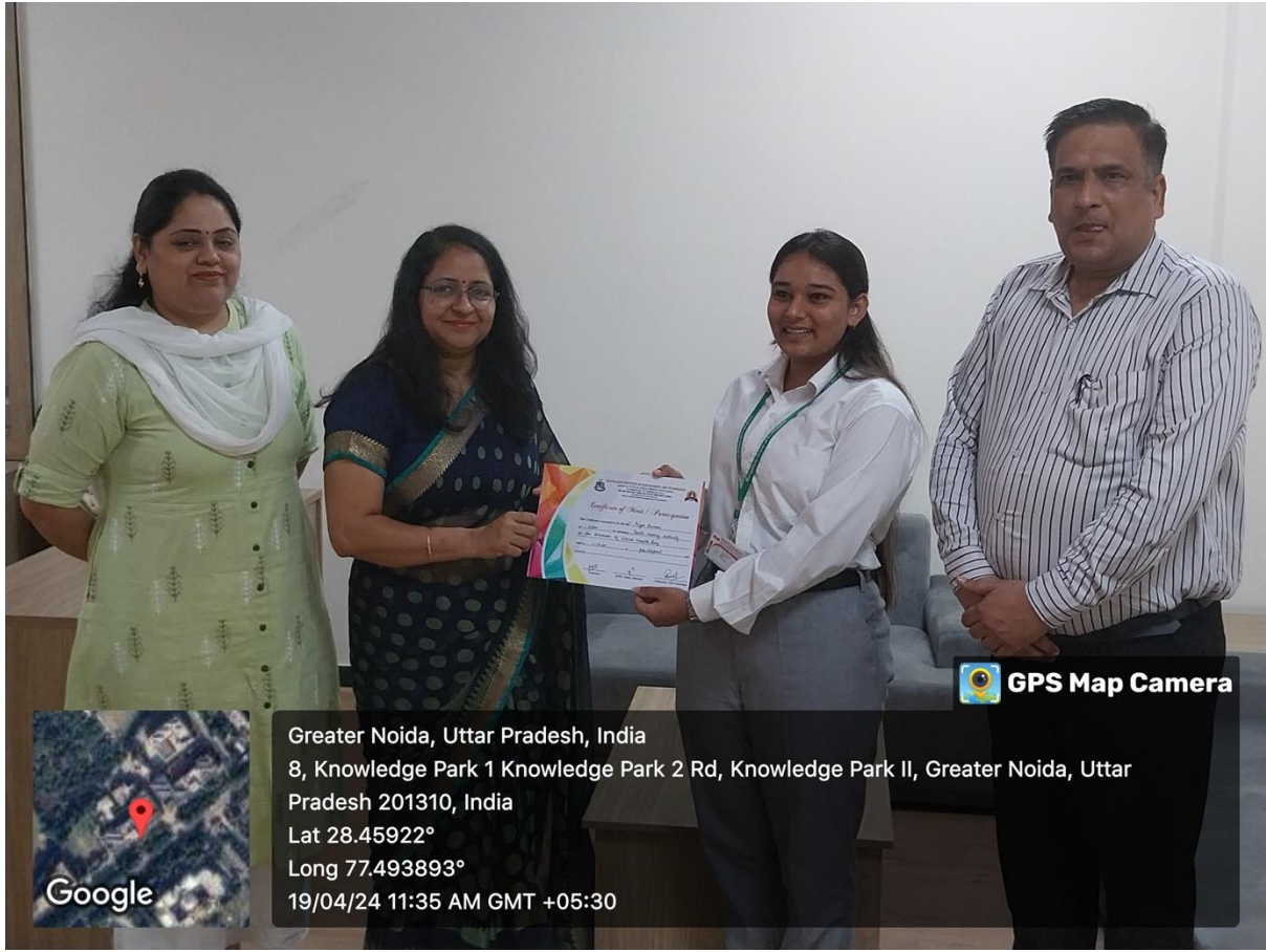
Figure 3 Price Distribution Ceremony on 19.04.2024