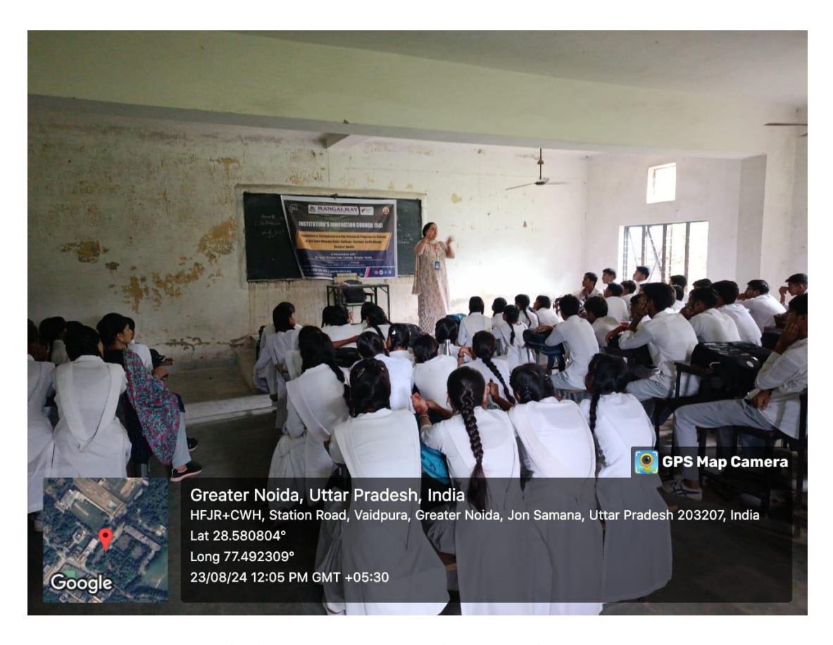
Pic 4: Resource Person is addressing the students

CAMPUS: 8 & 9, Knowledge Park-II, Greater Noida (U.P.) Ph. 0120-2328400, 2328401 Visit us at: www.mimt.org email: info@mangalmay.org