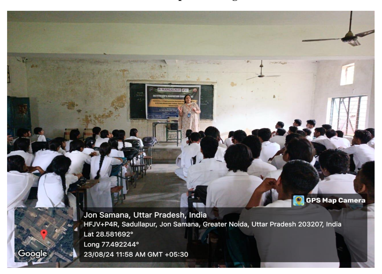
Pic 1: Resource Person is discussing about Innovation and Creativity with students