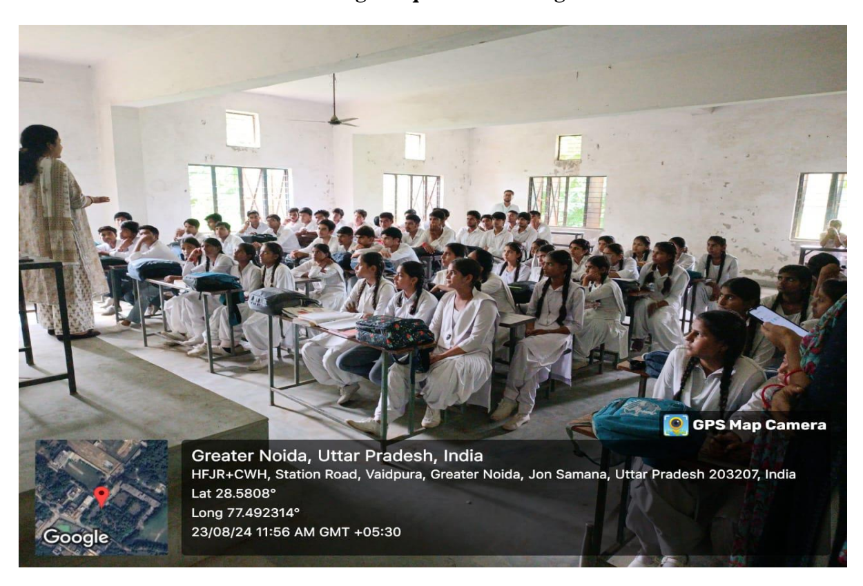
Pic 3: Students sharing their innovative ideas with the Resource Person