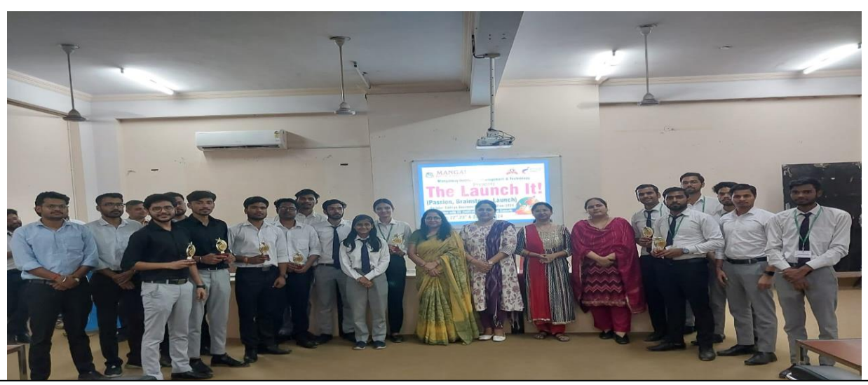
Day 3: Judges Interaction and Results. Closing, Felicitation and Certificate Distribution