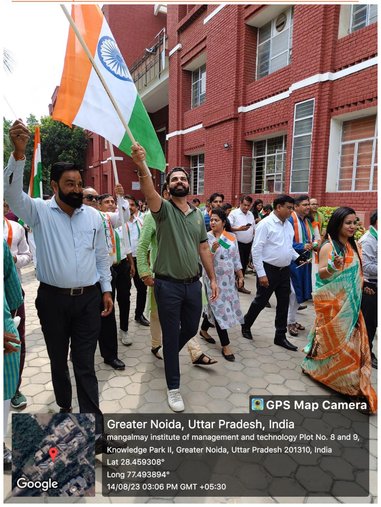
Rally on the occasion of Independence Day