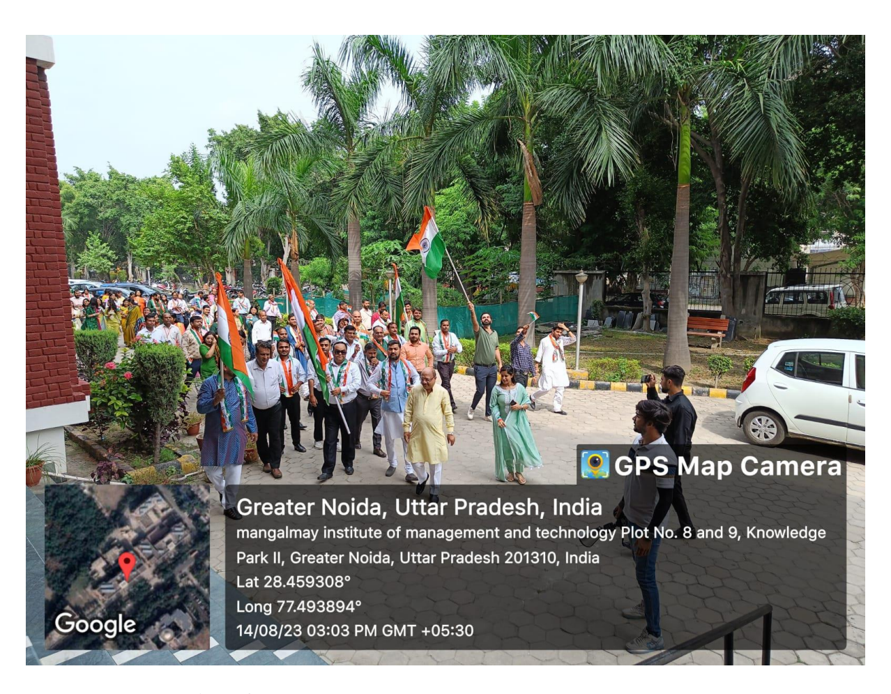
Rally on the occasion of Independence Day