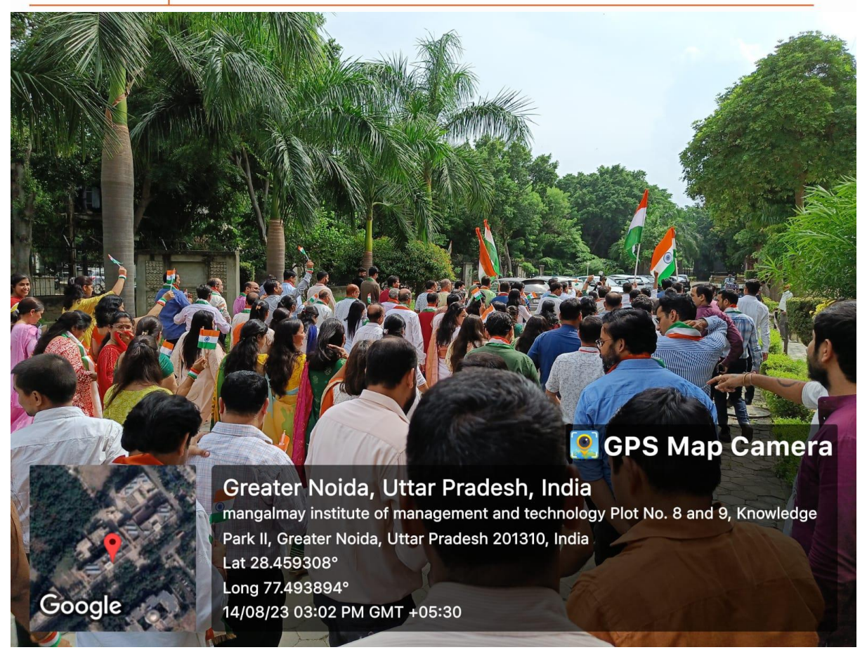
Rally on the occasion of Independence Day