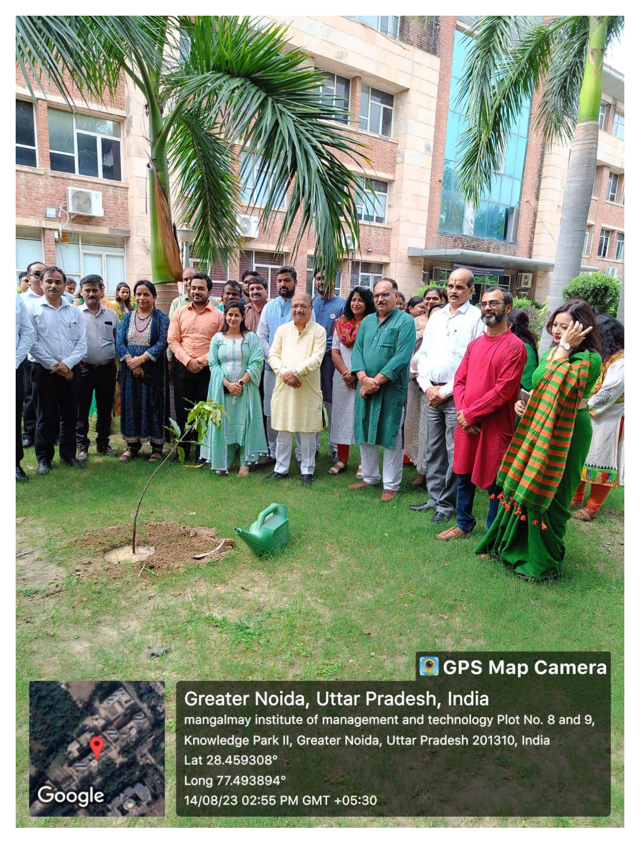
Tree Plantation in college campus on the occasion of Independence Day