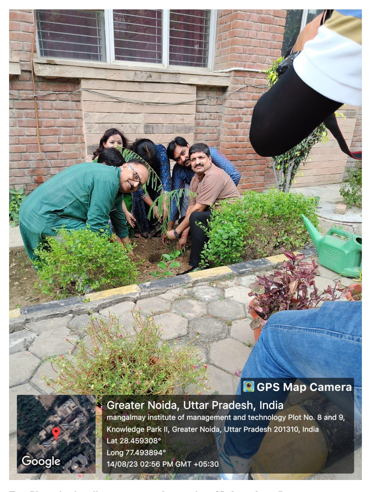
Tree Plantation in college campus on the occasion of Independence Day