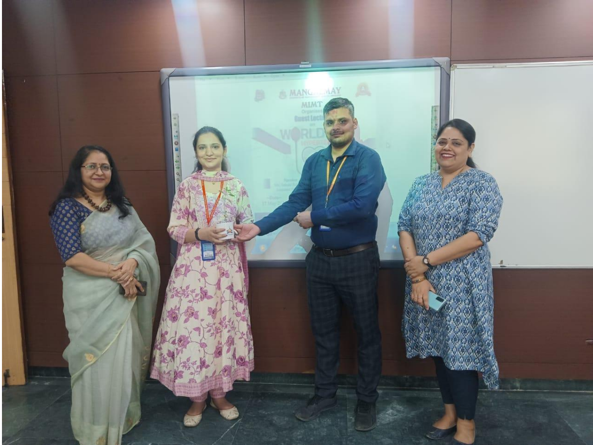
Figure 1 Welcoming the Guest Speaker with a Tulsi Plant: A Token of Appreciation at World Hypertension Day Celebration