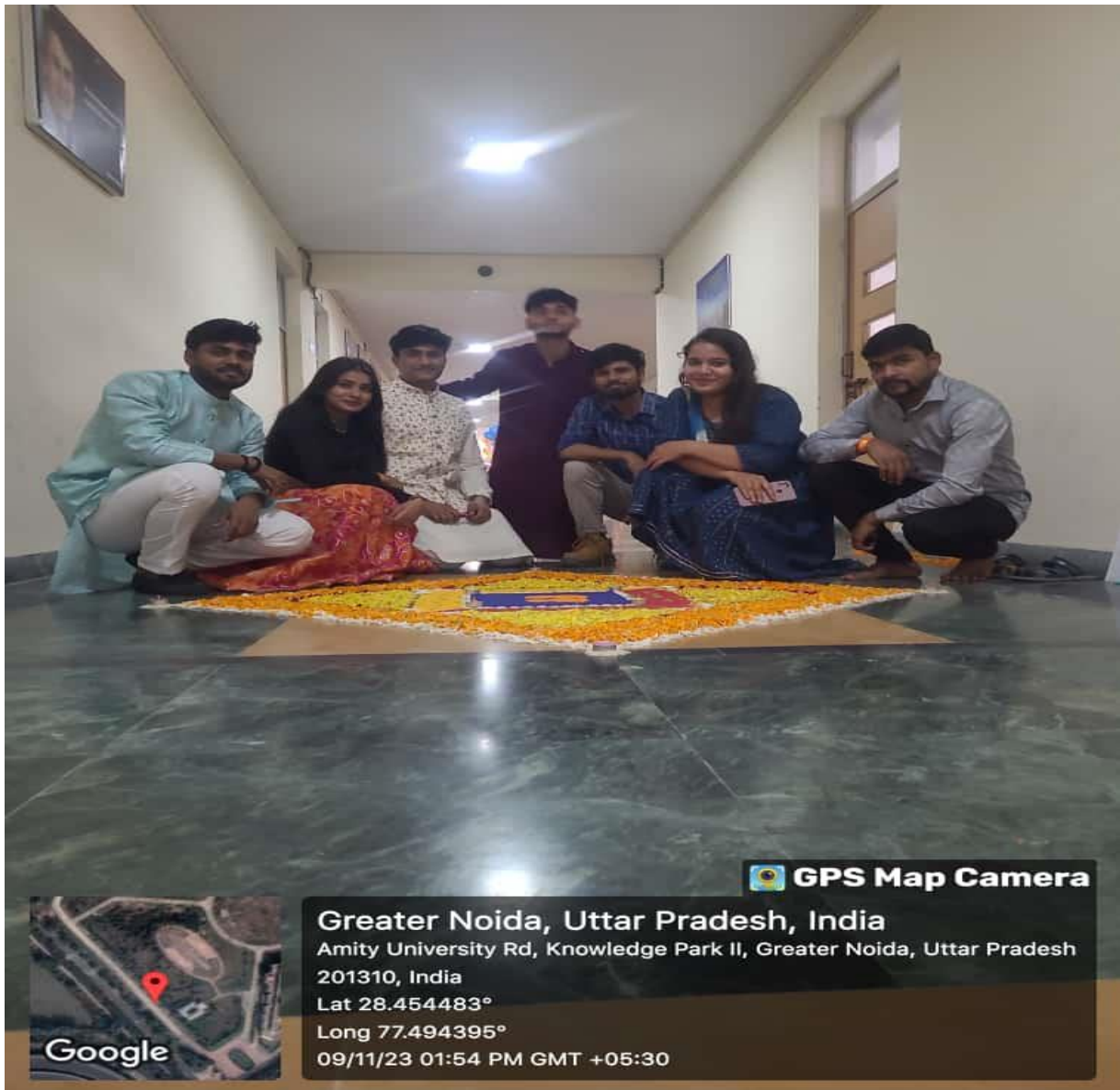
Students in frame with Rangoli in Diwali celebrations