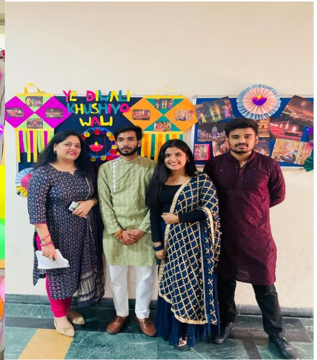
Students with faculties in Diwali Celebrations