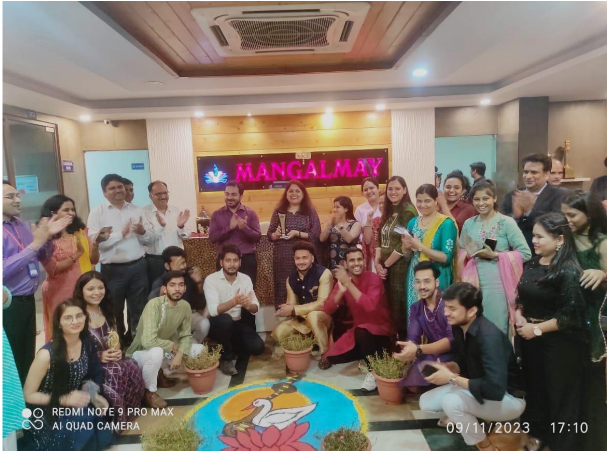
Students and faculties with trophy of “Best Decorated Department”