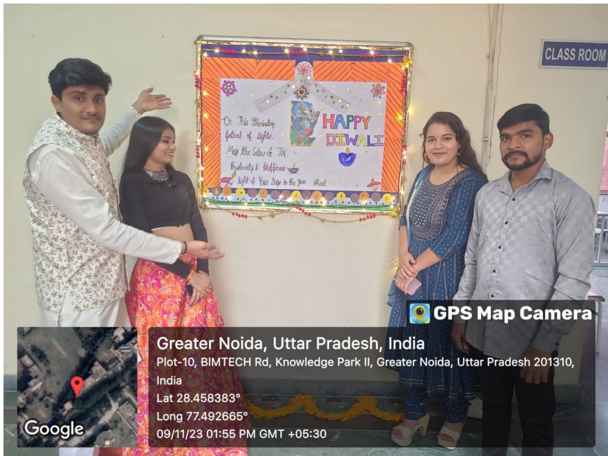
Students during Notice board decoration competition on Diwali Theme