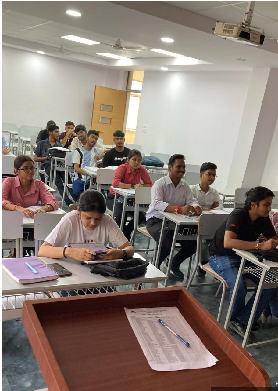
Figure 2 Students during World Aids Day