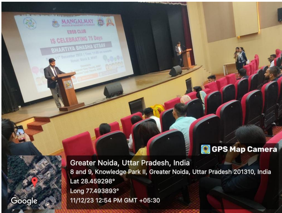
Pic 4: Creative writing during the event