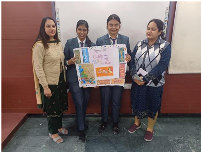
Pic 2: Poster making on different languages