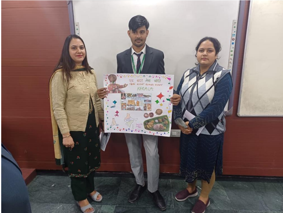
Pic 3: Poster making on different languages