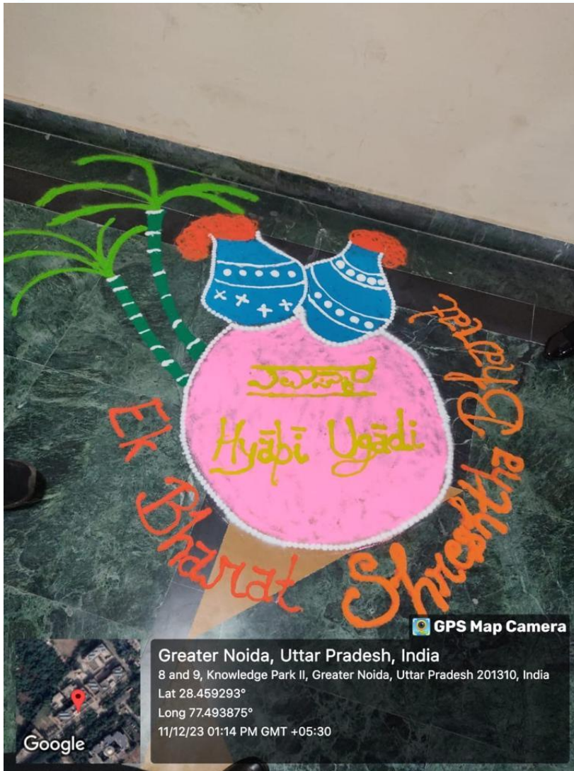
Pic 5: Rangoli making on Kannada Language