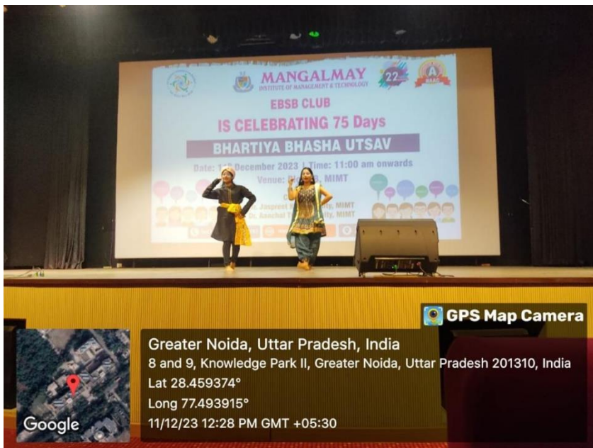
Pic 7: Cultural event on Bhartiya Bhasha Diwas