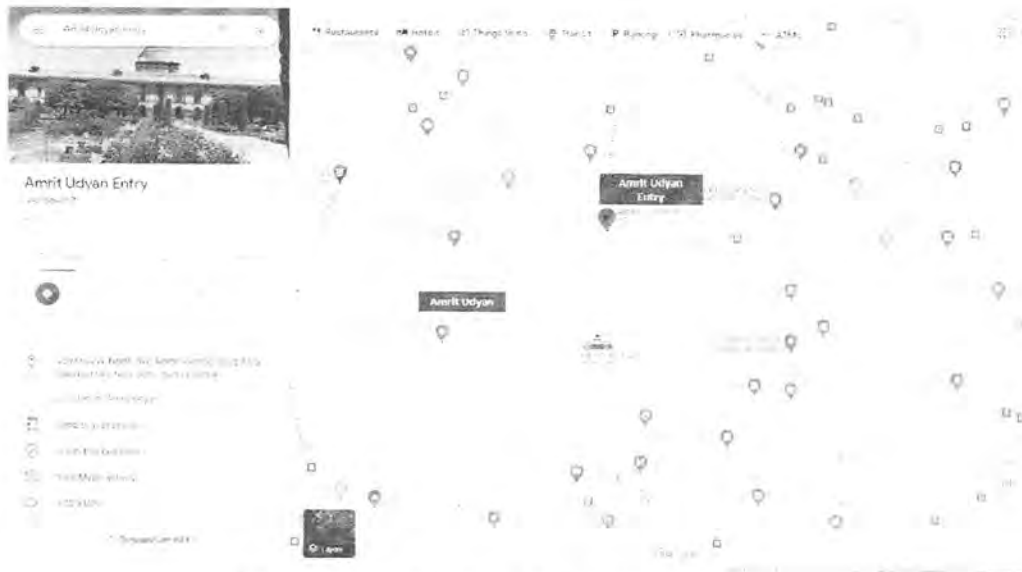
(Map with entry location at Gate 35 highlighted)