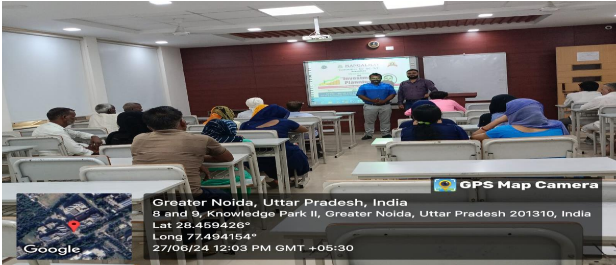
Session on Investment Planning