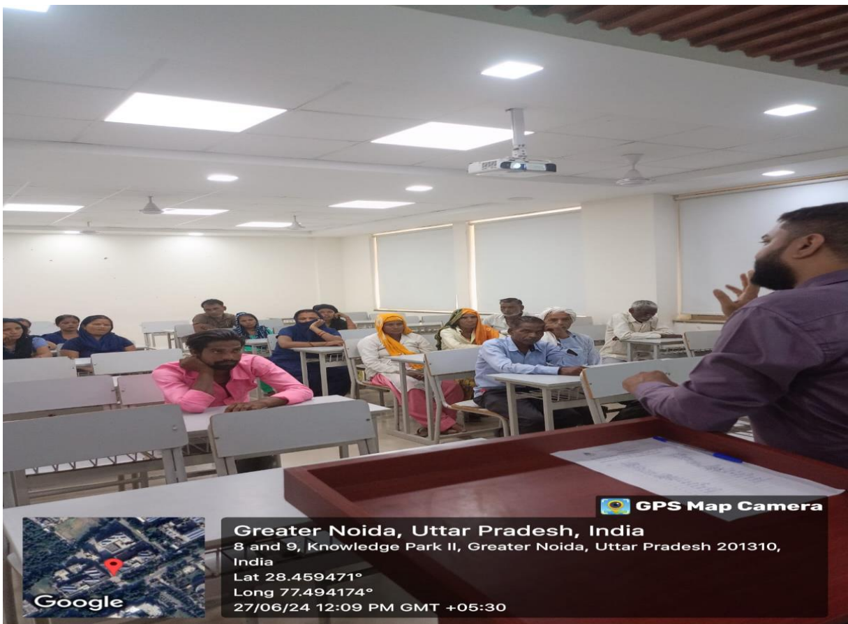
Resource Person in along with SC/ST Employees