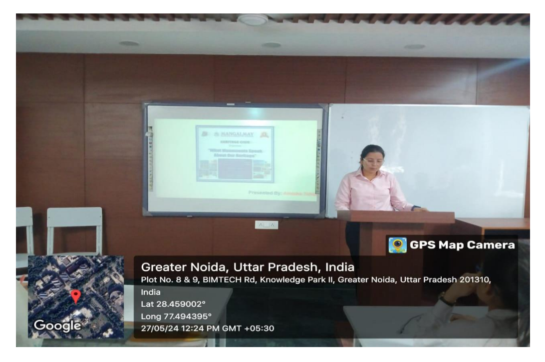
Figure 2 Students participating in What Monuments Speak About Our Heritage

Figure 1 Pic of the What Monuments Speak About Our Heritage