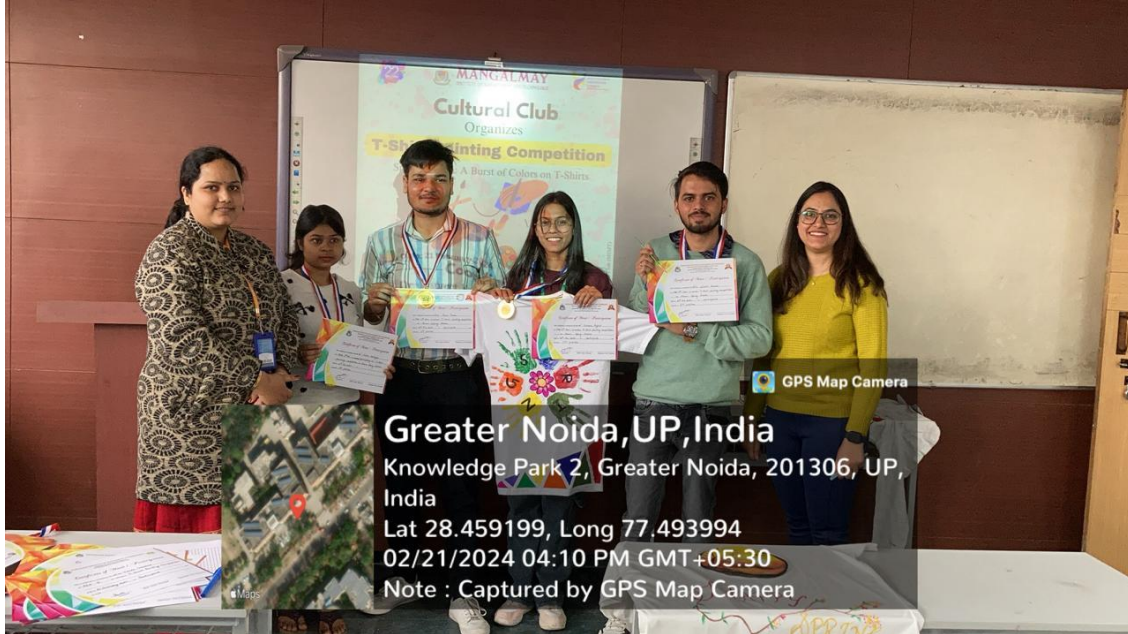
Winners of T-shirt painting competition held by cultural club, MIMT