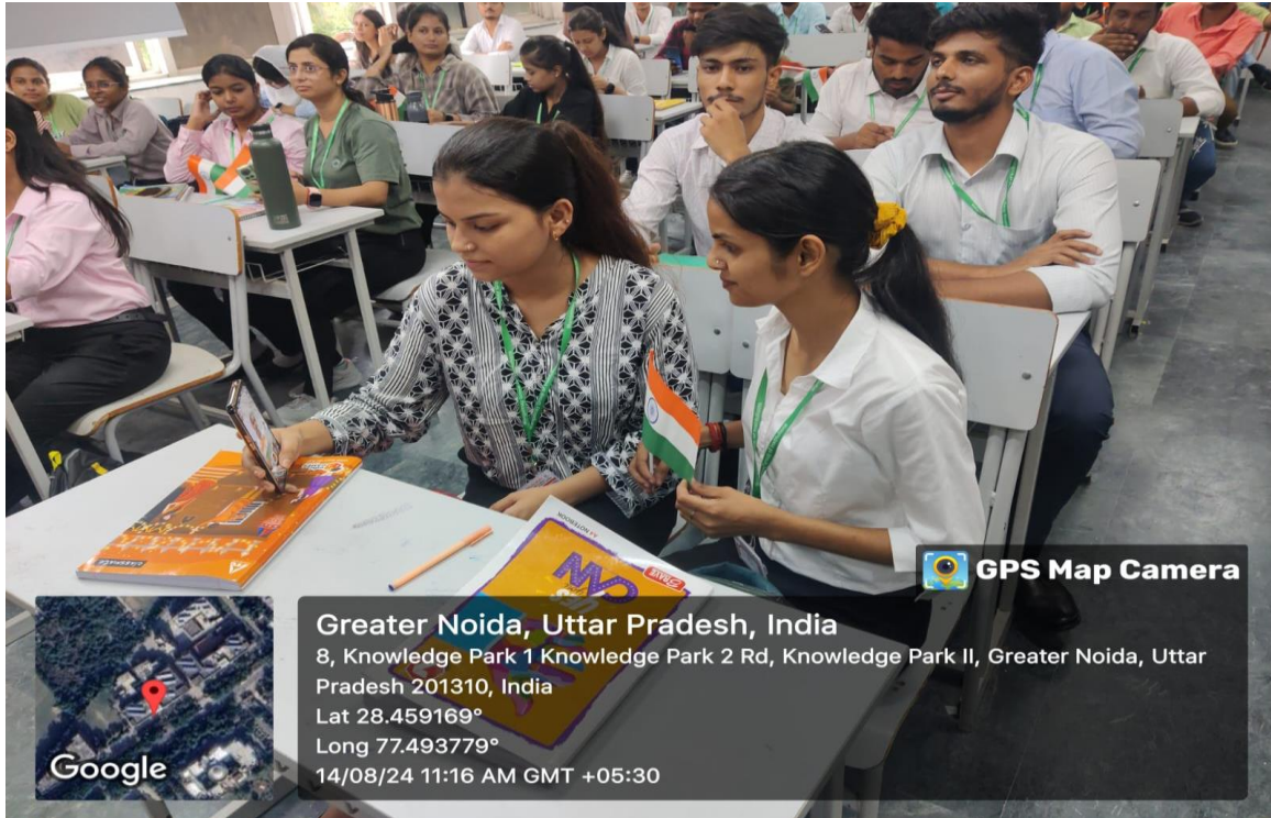
Picture 4: Students are celebrating unity and patriotism under the tricolor with pride