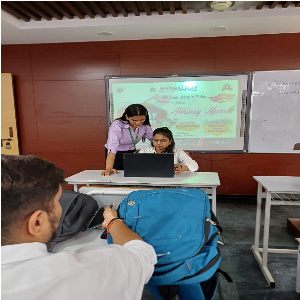
Office scenario represented by team.