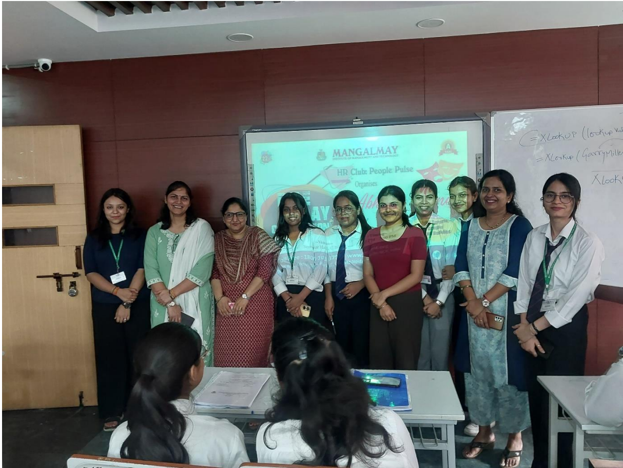
HR CLUB team group picture with judge of the event.