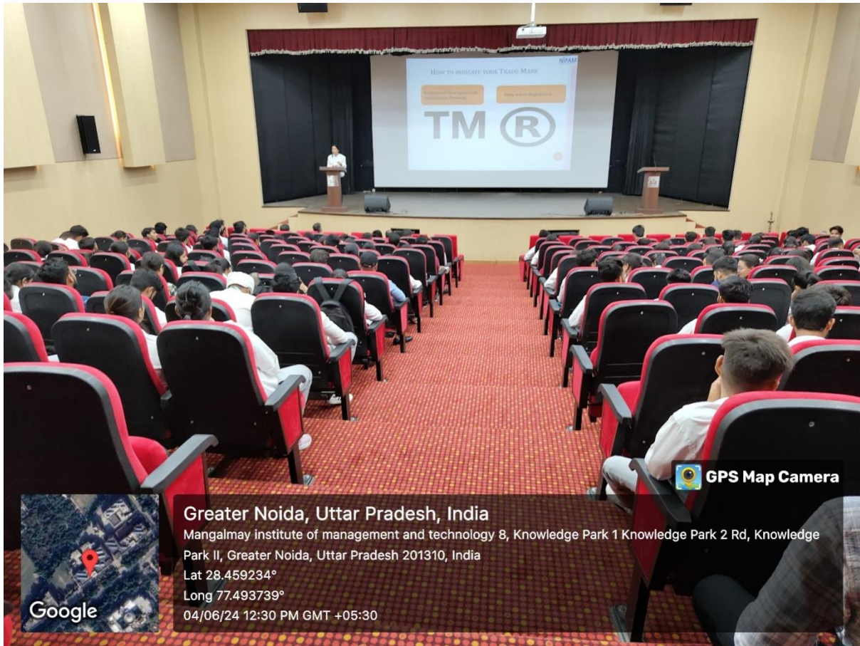
Pic5 – Students are learning about Trademark